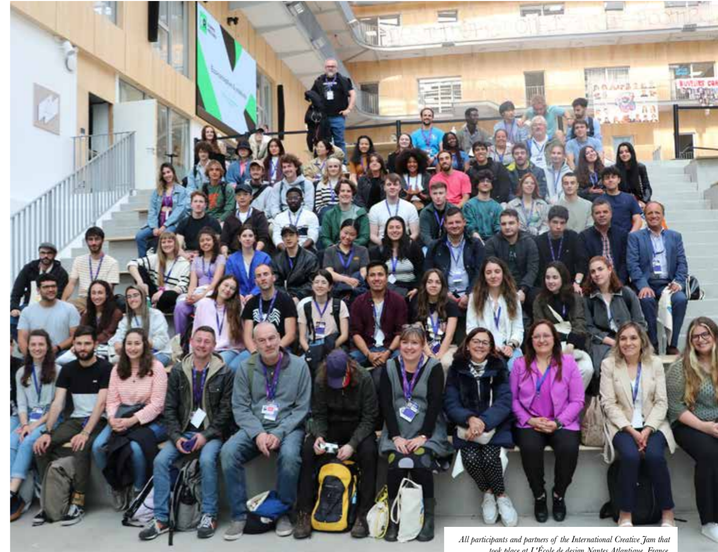
All participants and partners of the International Creative Jam that took place at L'École de design Nantes Atlantique, France, 10,11,12 May 2023